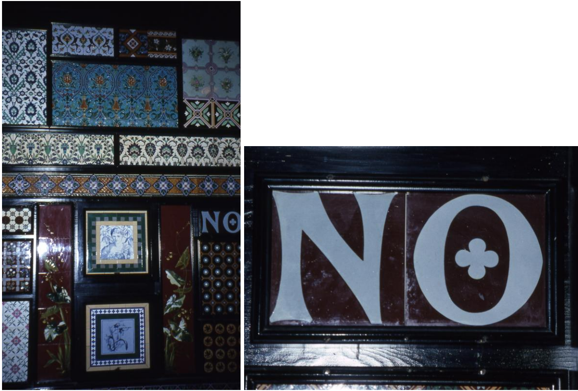
Figs. 9-10 A small part of the Minton display at the 1876 Philadelphia Centennial Exhibition, seen in 1991 at the Smithsonian, Washington DC