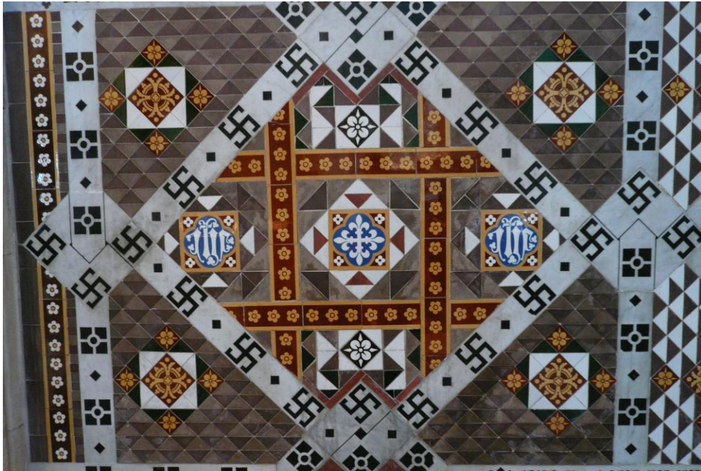
Figs. 1-4 Maw panels, Christchurch Cathedral

Minton tiles were used in the entrance hall of the lavishly decorated Larnach Castle (1875), a grandiose mansion near Dunedin, while Douulton faience formed the elaborate and colourful facings to the ticket office at Dunedin's railway station (1906).[8] Its mosaic floor, also by Douulton, had to be replaced around 1965 as it had sunk, but the new floor is an exact replica of the original, with assorted railway-related images (Figs. 5-8). (For the station's entry in the New Zealand Historic Places Trust Register see http://www.historic.org.nz/TheRegister/RegisterSearch/RegisterResults.aspx?RID=59 accessed 20.12.2011.)